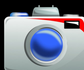
TS8 Civil War Begins