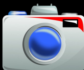
TS2 Map: United States (1861)