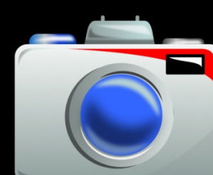
TS9 North and South

This example slide shows small camera icons that can be hyperlinked to entire videos and/or teaching segments in CCC! Technology. Teachers would search in CCC! for Abraham Lincoln to access videos/teaching segments that are appropriate to answer the key question. Once students have chosen leaders to compare/contrast to Lincoln, teachers would search in CCC! for related videos/teaching segments and create a new slide for students to easily access video resources.